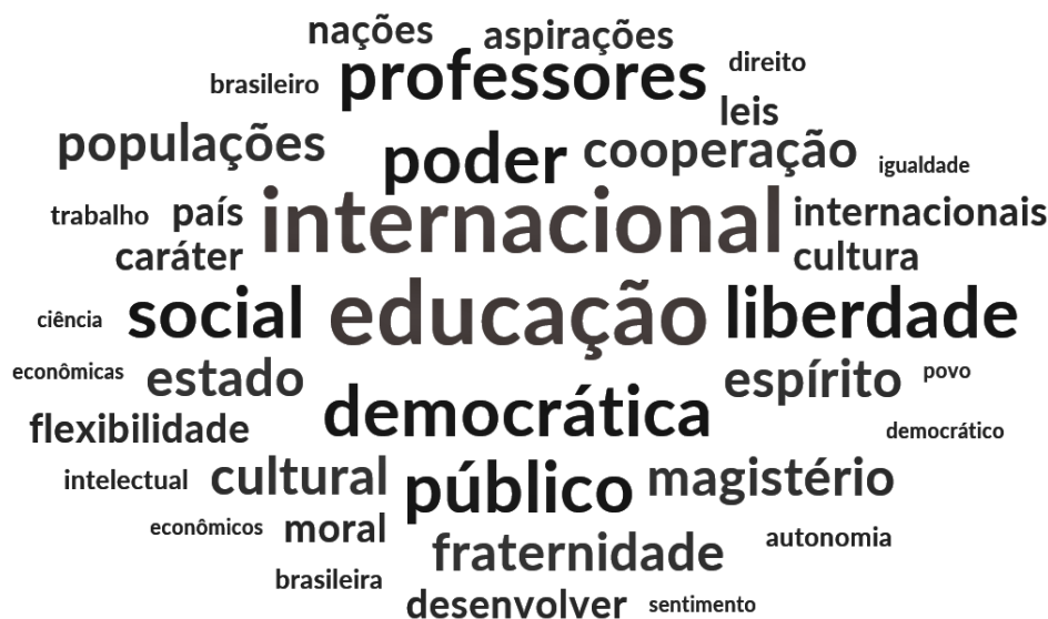
Figure 3 - Vocabulary present in the language game practiced in the debates of IX CBE.