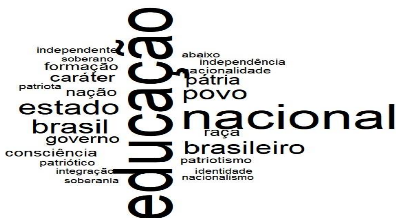
Figure 2 – Vocabulary present in the debates of ICNE (1927) relative to the concept of independence and its semantic correlates.