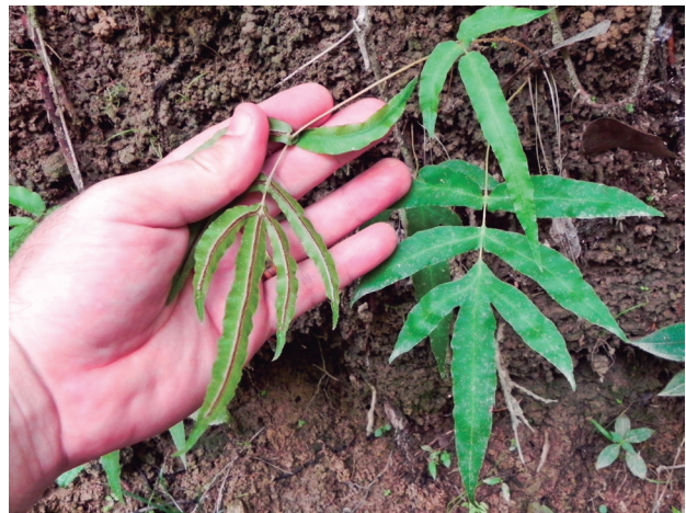
Figure 1. General habit of Blechnum heringeri .

Additional material examined: BRAZIL: PARÁ: Canaã dos Carajás, Serra do Tarzan, 6°06'19"S, 50°07'00"W, 540 m, 9-II-2012, A. Salino 15151 (BHCB); Monte Alegre, Serra do Itauajuri, 1°51.01'08"S, 54°2.42'04"W, 2-VII-2010, J.P. Pallos & R.M. Pietrobom 64 (HUEFS); Parauapebas, Serra do Rabo, 6°17'03"S, 49°55'02"W, 600 m, 16-XII-2010, N.F.O. Mota et al. 1921 (BHCB). MINAS GERAIS: Paracatu, Reserva do Acangaú, Capão da Guariroba, 17°12'14.5"S, 47°06'54.8"W, 700 m, 4-II-2006, A. Salino et al. 10743 (BHCB); São Roque de Minas, Parque Nacional da Serra da Canastra, Capão Forro, 20°15'11.9"S, 46°24'26.1"W, 970 m, 31-I-2007, A.