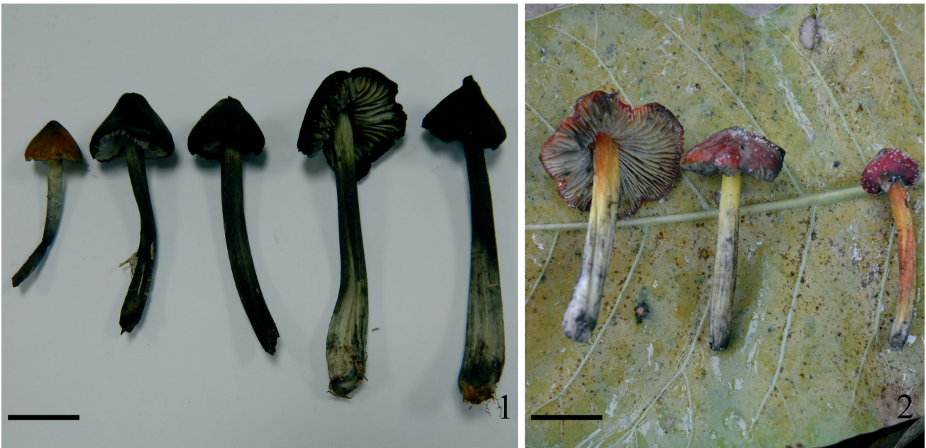
Figures 1-2. Basidiomata. 1. Hygrocybe conica var. conica (A.G.S. Silva-Filho 728). 2. Hygrocybe nigrescens var. brevispora (A.G.S. Silva-Filho 890). Scale bars = 10 mm.