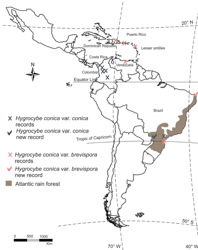
Figure 8. Known distribution of Hygrocybe conica var. conica and H. nigrescens var. brevispora in the Neotropical America.