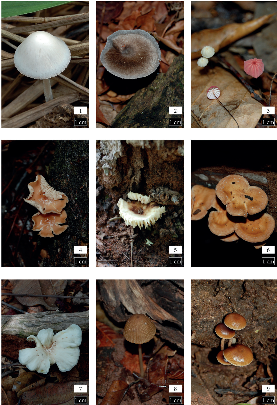
Figures 1-9. Agaricomycetes of the Maracaju Mountains, Mato Grosso do Sul State, Brazil. 1. Conocybe crispa . 2. Gymnopus dryophilus . 3. Marasmius androsaceus . 4. Marasmius oreades . 5. Mycena pura . 6. Rhodocollybia butyraceae . 7. Pleurotus eryngii . 8. Coprinellus micaceus . 9. Panaeolus rickenii .