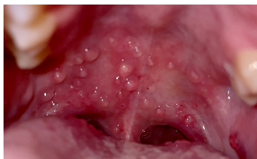
Figure 1 – Multiple translucent vesicles with inflammation on soft palate consistent with superficial mucoceles.

Symptomatic superficial mucoceles are an uncommon manifestation of oral cGVHD and appear as translucent vesicles on the palate or labial mucosae. 1,2 Topical or injectable corticosteroids are commonly used for management. 1,2