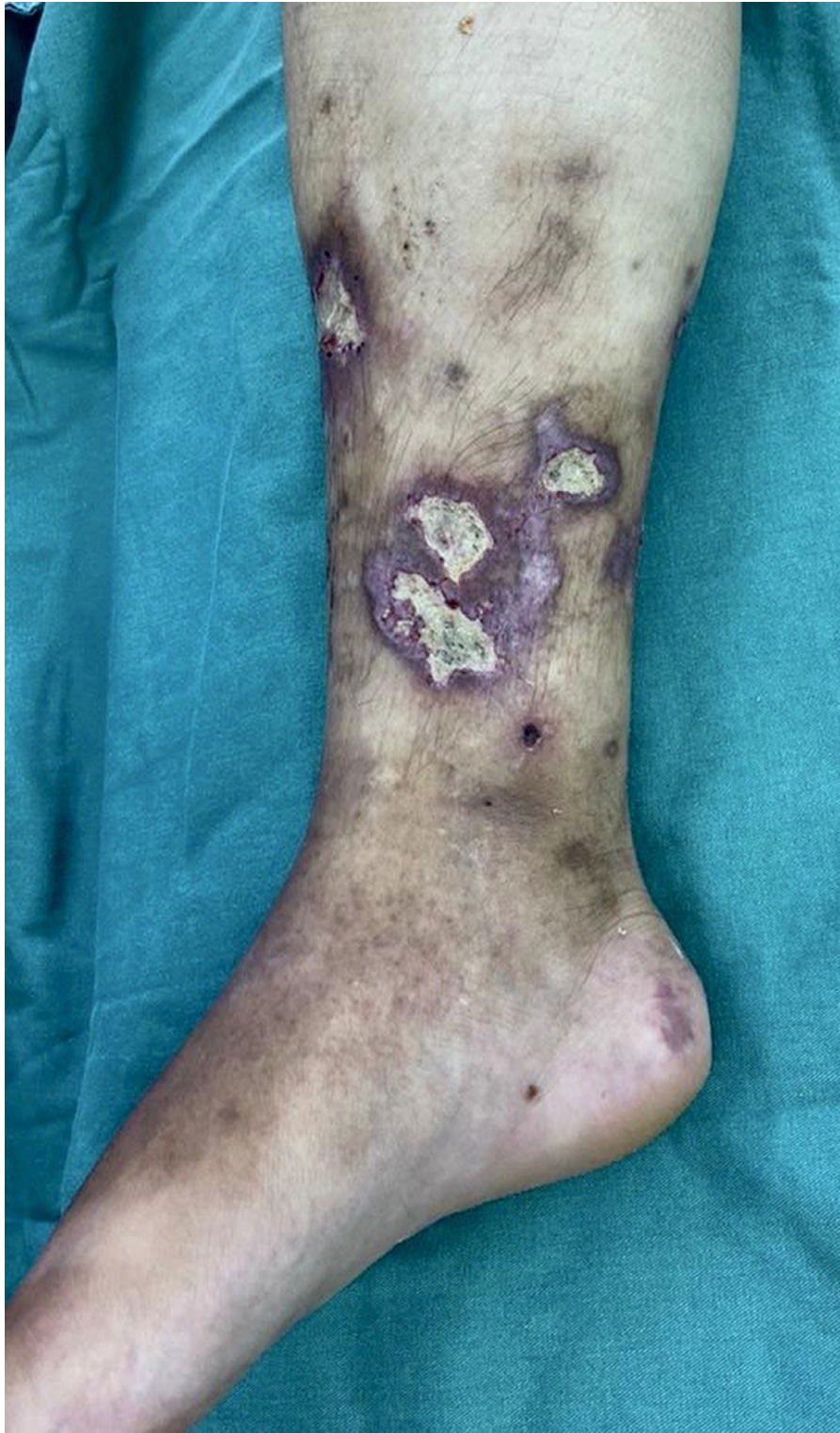
Figure 1 – Medial face of right leg.

differential diagnosis of CAS. In numerous publications such as Sapporo et al in 1999, Sydney et al in 2006 and Cervera et al in 2014, there is no mention of SK. 1,7