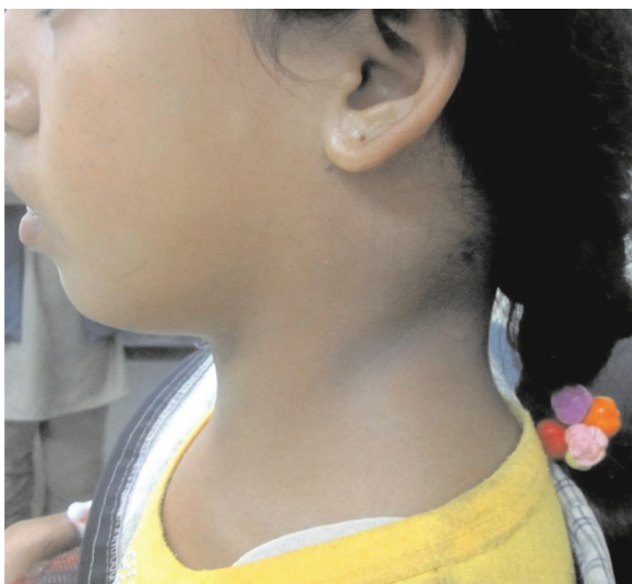
Fig. 1 Swelling over the mastoid and left upper neck.

Common signs and symptoms of Bezold abscess are fever, otalgia, and swelling at the cervical region, otorrhea, restricted cervical mobility, and hypoacusis. Therefore, this case has to be differentiated from other causes of neck abscesses. Computed tomography (CT) is a useful test in this disease, because it allows the identification of pus collections in the cervical region and mastoid involvement. 6