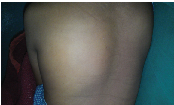
Fig. 2 Scapular swelling.

On physical examination, the patient was febrile (102°F) and with single, diffuse, 8 × 6-cm 2 swelling in left side of neck (→ Fig. 1 ) extending from the left mastoid tip to the lower attachment of the left sternomastoid muscle with erythema-