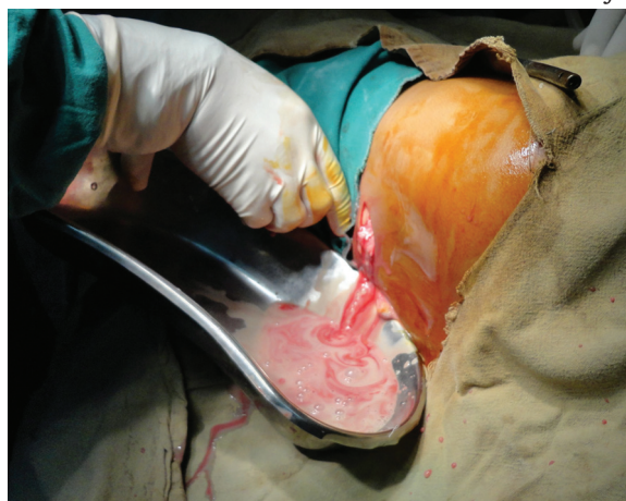
Fig. 4 Incision and drainage (I&D) of scapular abscess.

Left modified radical mastoidectomy with type III tympanoplasty was performed and the Bezold abscess was drained under general anesthesia. The mastoid cavity was found to be filled with pus and cholesteatoma debris. A small area of defective bone was found at the mastoid tip, through which there were communications between the mastoid cavity and