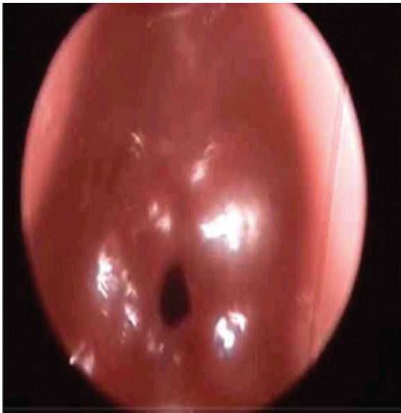
Fig. 1 Laryngoscopy showing stenosis grade III.

As exclusion criteria, the maximum length of time considered for the evolution of stenosis, that is, extubation failures and/or tracheostomy, had to be less than 30 days (considered acute stenosis), to exclude those patients with delayed stenosis. And the minimum follow-up period after becoming asymptomatic was 6 months.