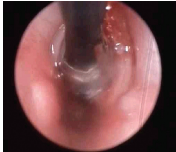
Fig. 2 Laryngoscopy during balloon dilatation.

► Table 1 shows the profiles of these patients, including their ages, evolution time, degree of stenosis, number of dilata-