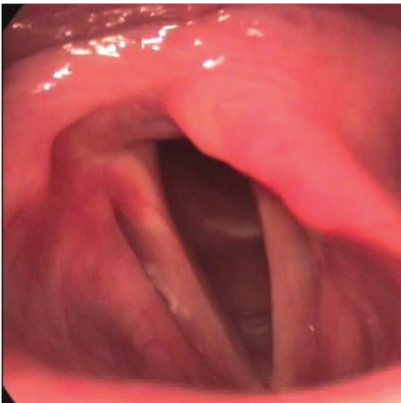
Fig. 1 Laryngoscopy image showing paramedian left vocal fold paralysis.

A 42-year-old man born in Rio de Janeiro presented to the Otorhinolaryngologic Service complaining of dry cough and thickness of his voice of 3 months' duration, combined with progressive dysphagia from solid to liquid. Otorhinolaryngologic physical exam discovered no alterations. Indirect laryngoscopy revealed left vocal fold paralysis at the paramedian position (► Fig. 1 ). Thoracic X-ray was requested, which showed a bulge adjacent to the aortic area; neck and cranium computerized tomography showed no alterations. Magnetic angioresonance of the mediastinum revealed a fusiform aneurysm of the thoracic aorta with laminar mural thrombi, measuring 7 cm in diameter and extending ~9.5 cm, with no evidence of dissection. The heart had normal dimensions (► Figs. 2, 3, and 4 ). These results indicated left recurrent laryngeal nerve paralysis by compression of the aortic artery. The patient was referred to the cardiovascular surgeon for surgical treatment of the aortic aneurysm, which was accomplished by means of endovascular surgery. Two months postoperatively, the patient still had dysphonia and vocal fold immobility.