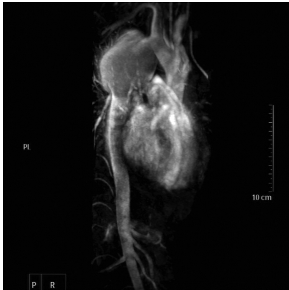
Fig. 4 MRI examination T1-weighted image, coronal cut for rotational rebuild with paramagnetic contrast, showing a fusiform aneurysm extending from the post emerging segment of the subclavian artery and demonstrating mural thrombi and misuse of adjacent structures. Note also topography of vagus nerve. Abbreviation: PL, posterior left; PR, posterior right.