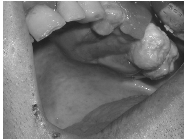
Fig. 2 Ulceration of the gingivae.

and tongue. 25,26 Plasmablastic lymphoma, a B cell lymphoma with a high proportion of plasmablastic lymphocytes, is the most common HIV-associated subtype in this location. 15,27 Constitutional symptoms such as fever and night sweats are frequent in PBL. Its typical appearance is a nonspecific ulceration that spreads rapidly and may eventually lead to hemorrhage, necrosis, and lytic bone destruction. A possible explanation for the high frequency of PBL in lymphoid areas of Waldeyer's ring and in epithelial cells of the cavum and oropharynx is the predilection of EBV to accumulate at these sites 28 (→Fig. 2).