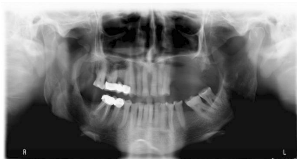
Fig. 4 Wide maxillary lysis in a patient with gingival lymphoma.

is the standard for staging in aggressive lymphomas and HL. PL is performed as part of staging in ARL and is used to identify lymphoma cells and to perform a PCR for EBV.