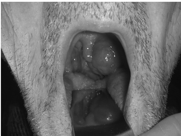
Fig. 1 Unilateral tonsillar hypertrophy in diffuse large B cell lymphoma.

Oral lymphomas occur more frequently in patients with HIV infection. Typical symptoms include oral swelling, pain, and ulcers. These lymphomas may present as a tumor or ulcerated lesion located anywhere in the mouth, but especially the gingivae, palate,