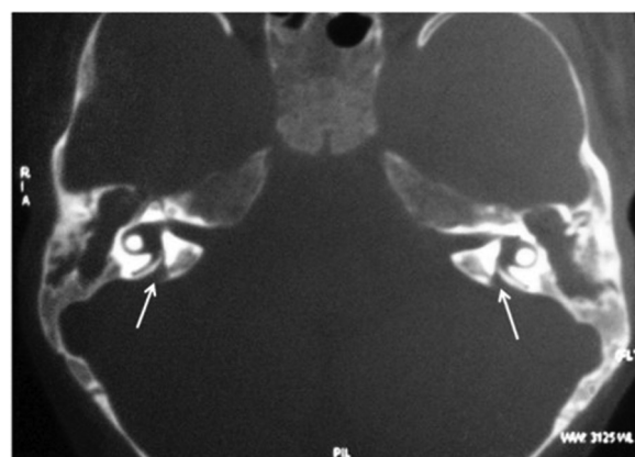
Fig. 1 Computed tomography scan of case 1 showing large vestibular aqueduct.

The patient underwent detailed audiological workup. Behavioral audiometry showed profound SNHL in both ears. Tympanogram showed A-type curve in both ears. Brain-stem evoked response audiometry (BERA) showed absent wave V on both sides at 90-dB nHL (normal Hearing Level) at the rate of 19.3/s using click and tone burst (500-Hz) stimuli. No distortion product otoacoustic emission was detected, which suggested outer hair cell dysfunction. High-resolution computed tomography (HRCT) of the temporal bone showed evidence of LVA with a diameter of 2.8 mm on both sides (▶ Fig. 1 ). He was also assessed by a child psychologist and speech pathologist. The patient and his parents were introduced to other implantees at the habilitation center run by Madras ENT Research Foundation (MERF) with regard to maintenance of the implant and auditory verbal habilitation.