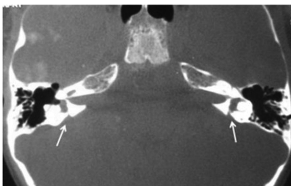
Fig. 2 Computed tomography scan of case 2 showing large vestibular aqueduct.

A boy 5 years and 9 months old born from consanguineous parents presented to our Implant Outpatient Department with a history of hearing problems noticed by the parents at the age of around 12 months, when the child had not developed speech and language. Antenatal, natal, and postnatal history was normal, as well as family history. His other developmental milestones were within normal limits. He was also assessed by the ENT consultant, audiologist, psychologist, and speech therapist. The entire audiological package