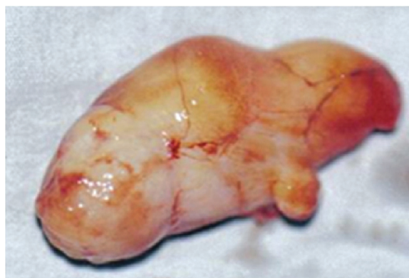
Fig. 2 Totally excised mass.

HP symptoms depend on the size and location of the lesion. 18 The most common symptoms of HP in the oronasopharynx may include rhinorrhea, recurrent cough, failure to gain weight, snoring, and sleep apnea during infancy 2-4 ; however, the latter two symptoms, although they might be life-threatening, have rarely been reported in the clinical presenta-