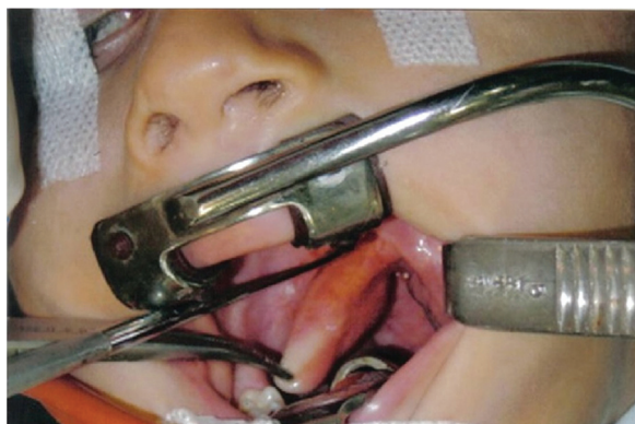
Fig. 1 A pedunculated mass originating from the supratonsillar fossa and posterior tonsillar fold.

There is still a debate regarding the etiology of dermoids and HP. There are basically three theories to explain the pathogenesis. According to the totipotential rest theory, DCs (dermoid cysts) arise from totipotent cells derived from ectodermal and mesodermal germinal layers. The congenital inclusion theory proposes inclusion of germinal layers into deeper tissues of fusion lines that have failed to undergo complete closure during embryonic life, leading to trapping of epithelial debris. Acquired implantation theory indicates