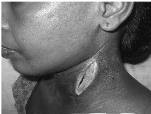
Fig. 3 Clinical picture showing post-incision and drainage of the neck abscess.

Beta-hemolytic Streptococcus is no longer the predominant organism causing LST. 9 Because of the use of antibiotics, during prodromal infection, chronic rather than acute infection more commonly precedes LST, and the blood culture is often negative. 10 Culture from the middle ear discharge characteristically yields mixed flora, including Pseudomonas , Proteus , Bacteroides , Staphylococcus , Enterobacteriaceae and other species. 11 In our study, 6 (40%) patients had negative cultures. In patients with positive cultures, Pseudomonas aeruginosa (4 cases; 44%) and Proteus mirabilis (4 cases; 44%) were the predominant organisms, followed by Escherichia coli (1 case; 11%) and Enterococcus fecalis (1 case; 11%).