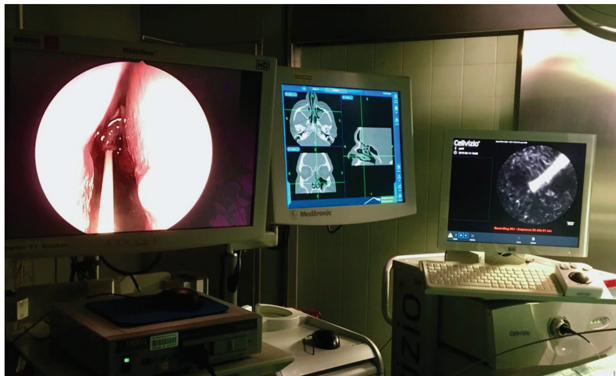
Fig. 1 Intraoperative setting from left to right: AIDA system for functional endoscopic sinus surgery, computed navigation (Medtronic) and confocal laser endomicroscopy (Cellvizio).

Confocal imaging provided instant real-time microscopic imaging during the ongoing surgical procedure. There