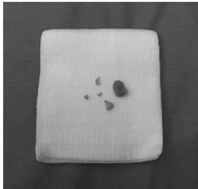
Fig. 2 Pieces of peanuts lodged in right bronchus retrieved.