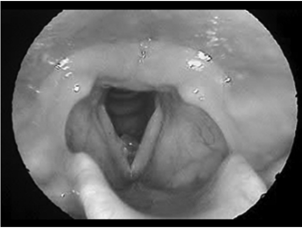
Fig. 1 Angiomatous polyp in the right vocal fold.