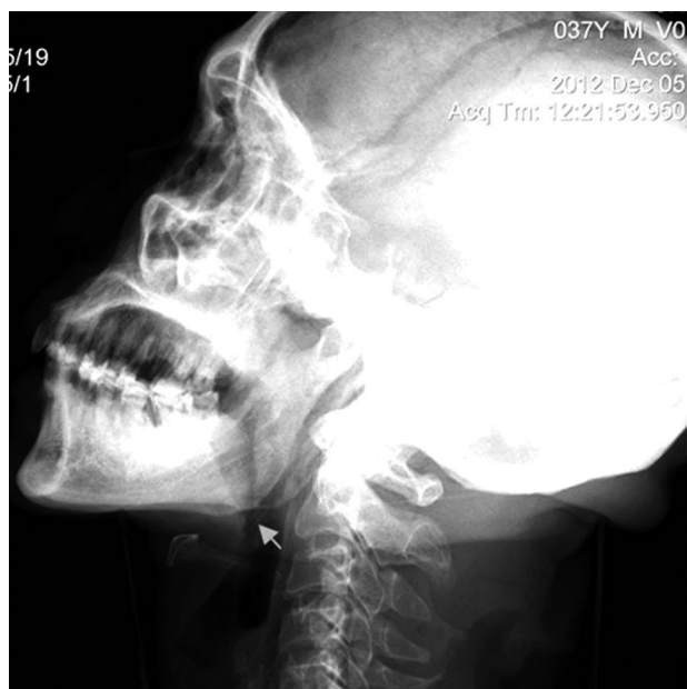
Fig. 2 The arrow indicates the embedded fishbone in fresh human cadaver's valleculae.

without fishbone for the three visibility groups. The same two radiologists interpreted the radiographs, who noted whether the fishbone was present or absent in the cadaver's throat and described the site of where the fishbone presented. The local ethics committee approved this study (HE551282).