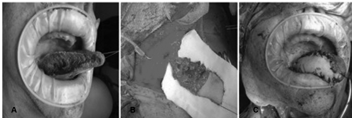
Fig. 1 Oral tongue reconstruction after ablative surgery. (A) Oral Tongue after resection. (B) Submental Flap. (C) Submental flap in the recipient site.

A total of 14 patients requiring an OSCC ablative surgery, reconstructed with a SAIF between January 2016 and January 2018 were included. There were 11 (78.6%) male and 3 (21.4%) female patients with a mean age of 66.7 14 (Min: 52/Max: 91) years old. Tumor sites involved were the tongue in 12 (85.7%) patients, the inferior lip in 1 (7.15%) patient, and the soft palate in 1 (7.15%) patient (→Fig. 2 and 3). All of the patients underwent ipsilateral or bilateral selective neck dissection after flap harvest. A total of 2 (14.3%) patients had a postoperative flap complication, one of them suffered partial necrosis of the flap and another patient suffered total necrosis of the flap. The mean hospital stay was 8–11 days (Min: 6/Max: 23 days), and the mean follow-up was of 12 months. None of them developed a local or regional recurrence during the follow-up. A total of 12 patients were alive