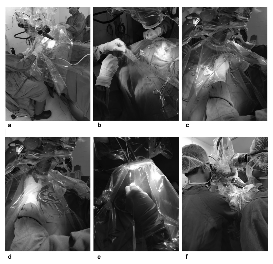
Fig. 1 Preparing the Microscope-Tent (MT). (a) Plastic sheet positioned (b) Access ports on the MT were created by cross-shape incisions made on the plastic sheets (c) Access ports on the MT at the height of the surgeon's arms (d) Fixed center of plastic sheet enclosed the microscope lens with rubber band (e) Cut plastic sheet to allow microscope lens (f) Auxiliary surgeon irrigation by extra small port near to ear on the periphery of the MT.