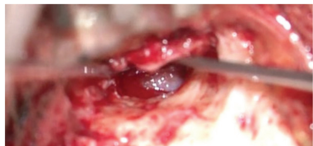
Fig. 1 Edited showing the tumor after elevation of the tympanomeatal flap.

The extent and margin of the tumor were examined all around. The drilling commenced in the posterosuperior region of the external auditory canal and the outer attic wall to expose the ossicles. → Fig. 2 The tumor could then be easily dissected around the ossicles, thus preserving the hearing. Thereafter, the drilling was performed judiciously in the posteroinferior part as the facial nerve runs lateral to the tympanic annulus in this region. The hypotympanic air cells were then exposed, and the tumor was delineated all