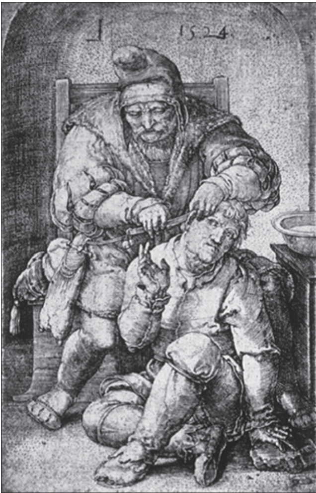
Figure 1. Early mastoid surgery as performed by a barber surgeon. Incision to drain abscesses has been practiced since ancient times. Lucas van Leyden, 1494–1533; The Surgeon , 1524.