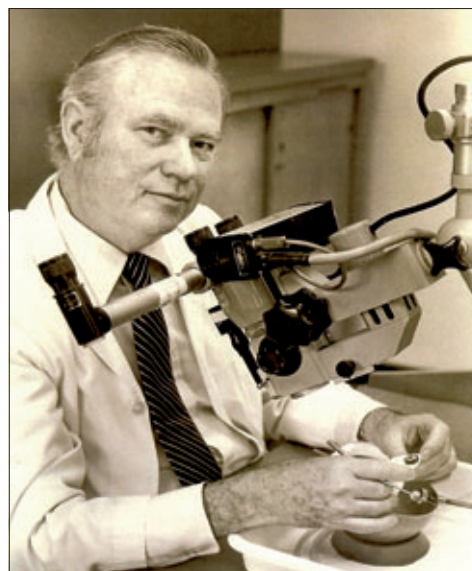
Figure 7. William House. American surgeon who introduced modern techniques of mastoidectomy and the use of mastoid access in otoneurosurgery.

Mastoidectomy continues to be a life-saving surgical procedure.