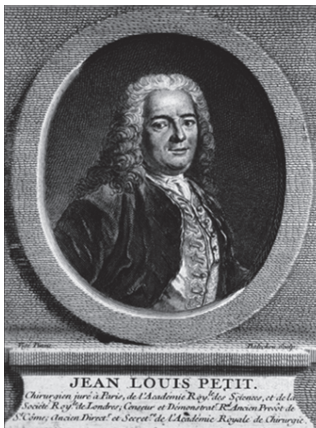
Figure 3. Jean Louis Petit (1674–1750). French surgeon who was the first to formally describe opening the mastoid, in a text published posthumously in 1774.

this period, he created a type of tourniquet for which he became famous. This was applied as a “screw tourniquet” and was used to contain hemorrhage before and after surgical procedures. Petit is credited with a level of expertise in mastoid surgeries unequalled in his time (17).