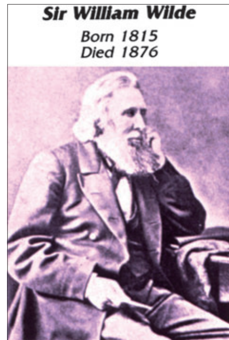
Figure 5. Irish surgeon who popularized the retroauricular incision.

Interest in mastoid surgery did not fade completely in the early 19th century. However, most surgeons performed mastoidectomy only in certain situations and for specific indications. In 1838, J. E. Dezeimeris wrote that reports describing complications due to mastoidectomies should be collected before the procedure was definitively