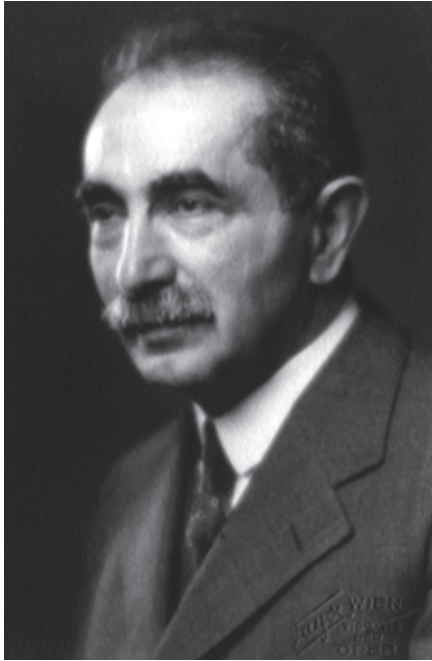
Figure 6. Gustave Bondy (1870–1954), Austrian surgeon (University of Vienna), popularized the modified radical mastoidectomy in which some or all of the middle ear structures were preserved in order to attempt to preserve hearing.

In order to release the purulent secretions confined within the antrum and the attic, Bondy removed the bone up to the external wall of the attic. He intended to preserve the tense part of the tympanic membrane and, if possible, the ossicles. A meatal skin flap was used to seal the defect between the epitympanum and mesotympanum; alternatively, when the ossicles were preserved, the flaps could be used to cover the exposed bodies (49-51).