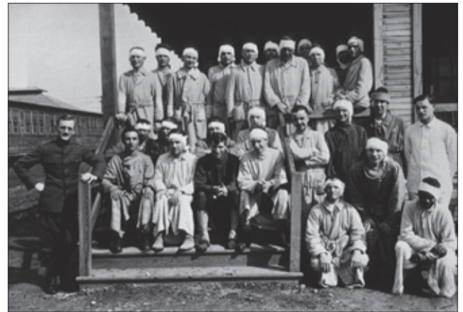
Figure 2. "Mastoid Club"—Picture from the time of the first World War illustrating how frequently mastoidectomies were performed. (Sander and colleagues, 2006).

The first documented surgical incision to drain an infected ear was described by the French physician Ambroise Paré in the 16 th century (8-11). Paré is credited with recommending drainage to François II, King of France, in 1560 (12). The king died of ear infection soon after; he did not undergo surgery because his mother, Catherine de Medicis, would not allow it (13).