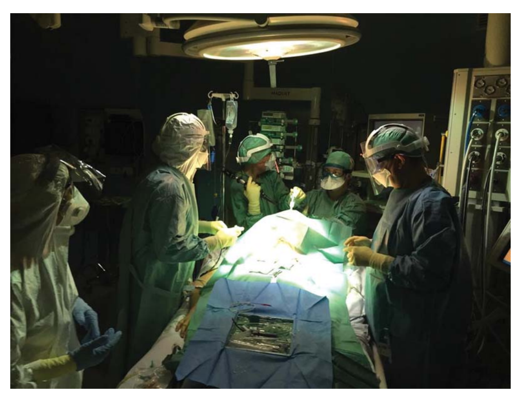
Fig.1 Tracheostomy procedure performed in a COVID-19 patient on veno-venous extracorporeal membrane oxygenation, personnel wearing full PPE.