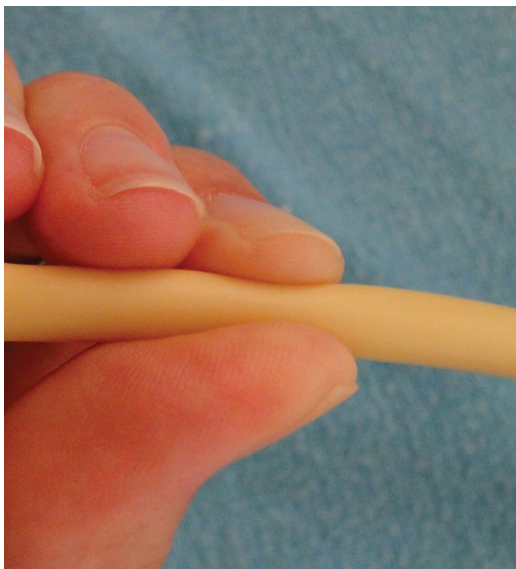
Fig. 3 Squeezing the Foley catheter with the fingertips may restore permeability of the segment of tube collapsed by the device used to secure the catheter in the nose.

Bursting a Foley balloon containing liquid inside the nasopharynx may theoretically result in bronchoaspiration; however, the volume of liquid used to inflate the balloon is small, 13 and for anatomical reasons it is more likely to reach the oropharynx in the form of posterior drainage.