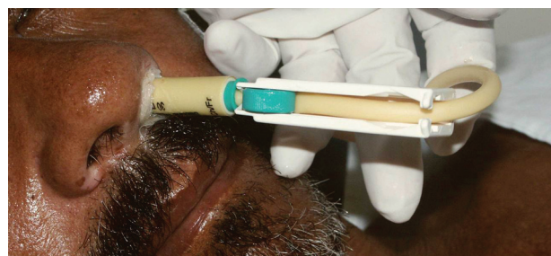
Fig. 2 Securing the Foley catheter in the nose using the valve of the device (a parenteral infusion set).

It is possible to burst the Foley catheter balloon inside the nasopharynx using endoscopy and a perforating instrument. Nevertheless, bursting the Foley catheter balloon may release free fragments of latex. 12