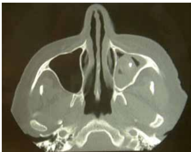
Figure 2. TC of face presenting thickening of the mucous covering of the maxillary sinus left and mass of density of soft parts with calcifications.