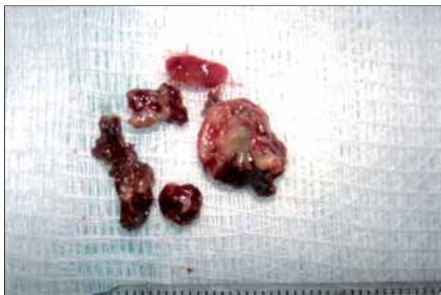
Figure 1. Surgical part after maxillary sinusotomy.