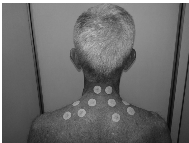
Fig. 2 Distribution of the 10 tablets containing nanotubes.

In a preliminary study conducted before this one, we noticed a decrease in pain and dizziness scores throughout two weeks of patches treatment. Therefore, we tracked out the patient on a biweekly basis. We changed the patches during the first visit, which was 15 days after the beginning of treatment. At this point, one of the subjects was excluded from the study due to patch loss. We recorded the remaining seven subjects pain and dizziness levels using the VAS on a twice week basis. A Computerized Dynamic Posturography (CPD) was performed at the end of four weeks. We plotted sex, age, pain, and dizziness scores in a table. We analyzed