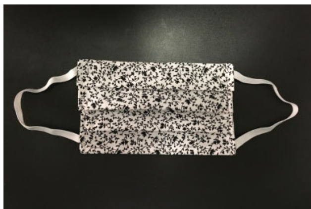
Fig. 2 Handmade Mask (100% cotton - Washable).

transmission of COVID-19. Although there is experimental evidence that facemasks are capable of retaining infectious droplets and potentially reduce transmission, as well as reports of transmission reduction by using facemasks, there is no evidence that such reduction occurs in community environments. Epidemiological studies are needed to eluci-