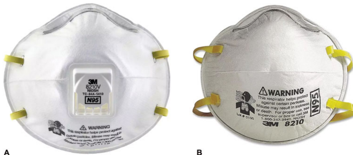
Fig. 1 N95 Respirators 3M (With and Without Valve - Disposable).