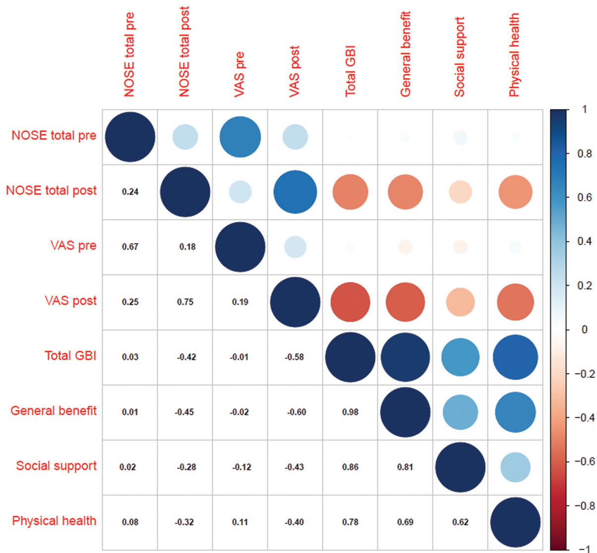
Fig. 2 Nasal obstructive subjective scales (NOSE and VAS) and the Glasgow Benefit Inventory (GBI) correlation matrix

as possible and clarify the expected results after the medical and surgical treatment is performed.