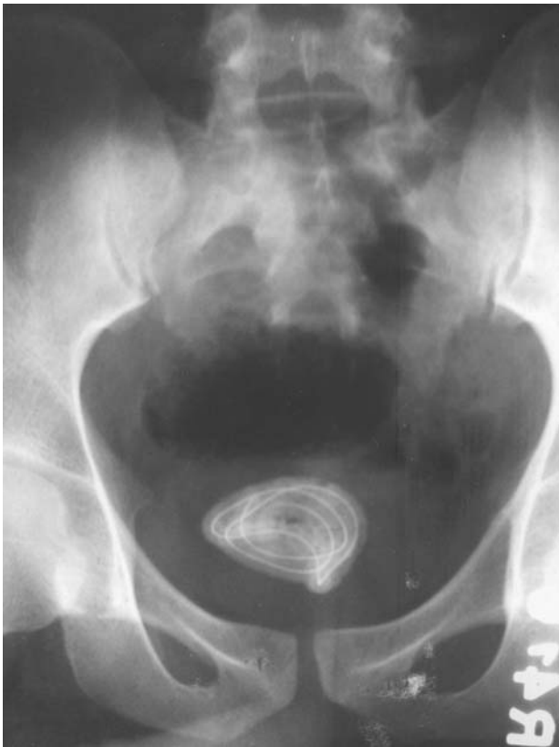
Figure 2 – X-ray of the pelvis demonstrates a coiled up wire within a stone in the urinary bladder.

Case 2 - A 22-year-old boy presented severe burning micturation with poor urinary stream over the past 2 months. He had a history of repeated attacks of urinary tract infections in the last few years. A physical examination revealed meatal stenosis with tenderness in the suprapubic region. Urinalysis showed plenty of pus cells along with red blood cells. Urine culture showed the growth of E. coli 10^7 CFU/mL. An X-ray of the pelvis suggested a large bladder stone with a coiled up wire inside it (Figure-2). The parents of the patient admitted that in his childhood a quack had introduced an electric wire through his urethra for treatment of meatal stenosis. They did not know whether it had ever been removed or not. The stone was removed by cystolitholapaxy and the wire was removed by cystoscopy after a meatotomy.