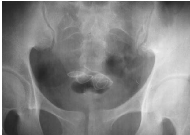
Figure 3 – X-ray of the pelvis showing coiled up wire in the urinary bladder.

Case 3 - A 16-year old boy presented with features of acute cystitis for a previous few days. Clinical examination was unremarkable except for suprapubic tenderness. A urine examination showed plenty of pus and red blood cells. Urine culture showed a growth of Pseudomonas 10^6 CFU/mL. A pelvic ultrasound showed an echogenic foreign body in the urinary bladder. An X-ray of the pelvis showed a coiled wire in the urinary bladder (Figure-3). On further interrogation, the patient admitted that a wire was introduced by his sexual partner for more sexual gratification and he had lost the tail end of the wire. Cystoscopy confirmed the wire in the bladder, which was removed under general anesthesia.