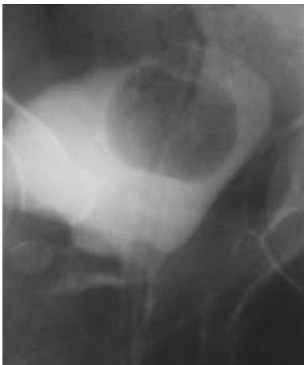
Figure 4 - Cystographic control showing minimum extravasation of contrast medium and descending of bladder to its anatomical position.

Foley catheter was effective. The incidence of disruption of vesicourethral anastomosis is 0.2% to 0.5% (7-9) and the best management is still a subject for discussion.