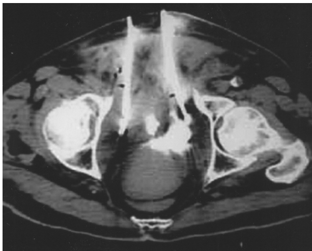
Figure 2 - Percutaneous drainage of hematoma, guided by computerized tomography.

This work demonstrated that conservative management for treating post-RRP rupture of vesicourethral anastomosis through permanence of