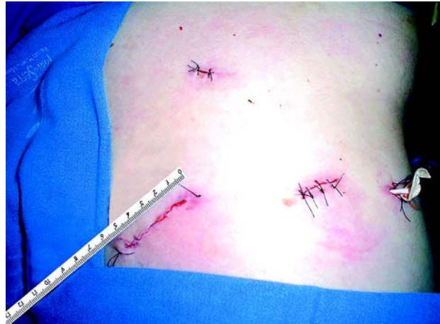
Figure 3 – Final aspect of the incisions. The specimen was removed by the 5 cm inguinal incision. A Penrose drain is left in the dorsal surgeon working port.

There were no major complications. Six patients developed abdominal body wall complications: three patients developed subcutaneous emphysema with no clinical repercussion and a spontaneous resolution; two patients developed surgical wound hematoma in the first trocar incision and one patient