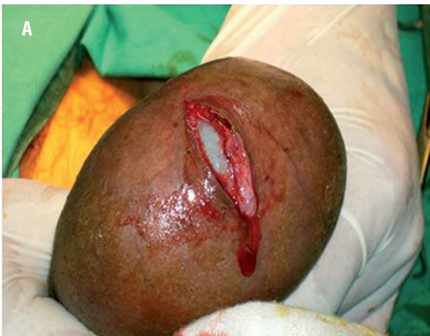
Figure 1A - An operative photograph showing the length of the scrotal skin incision, 2cm (it appears longer due to stretch of the skin by the assistant).