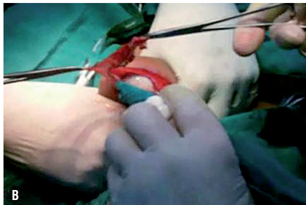
Figure 2B - An operative photograph showing in situ excision of the hydrocele sac using electrocautery.