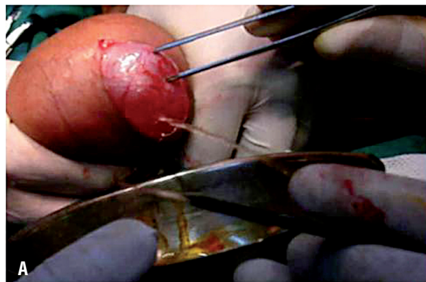
Figure 2A - An operative photograph showing evacuation of hydrocele fluid through a small hole made in the tunica vaginalis.