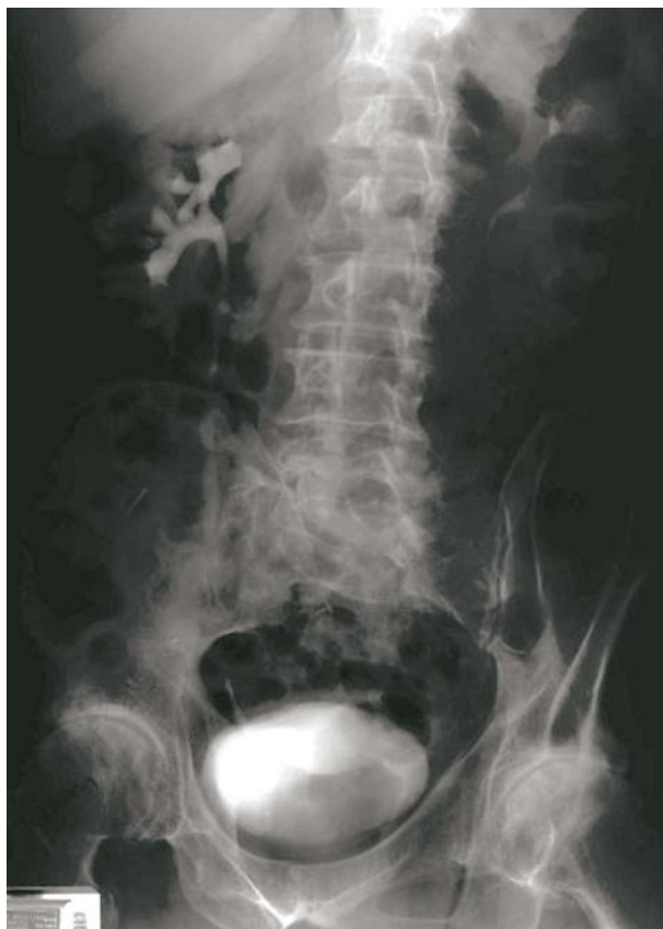
Figure 3 – Intravenous pyelogram at eight months postoperatively showing a patent graft with no evidence of stricture or hydronephrosis.

for leakage by injecting methylene blue through the indwelling nephrostomy tube.