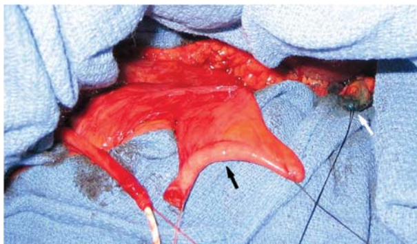
Figure 1 – Proximal ureteral defect measuring 8-10 cm with appendix rotated into position (black arrow). Dark suture at right renal pelvis (white arrow).

tip and detached from the cecum. Special attention was given to preserving the appendicular arteries and mesoappendix (Figure-1). The appendix was cannulated to accommodate a 14 French endopyelotomy stent. Next, the appendix was rotated up to the level of the renal pelvis to ensure a tension free anastomosis. It was then oriented in isoperistaltic fashion with its distal tip abutting the renal pelvis. A spatulated uretero-appendiceal anastomosis was performed on both ends of the graft (Figure-2). The anastomosis was then tested