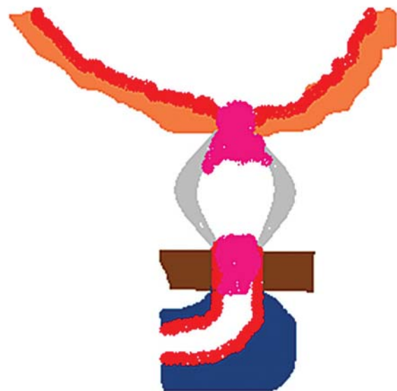
Figure 2 – Proposed pathogenesis for strictures at the bladder neck and membranous urethra. A) Immediate postoperative situation after TURP. B) Accumulation of fibrin and blood clots at the bladder neck and membranous urethra finally leading to stricture formation.