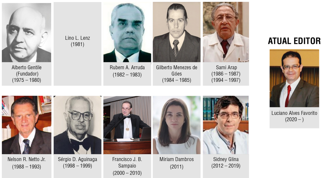
Figure 1 - In this figure we can observe the operating time of the former editors of International Brazilian Journal of Urology in the last 50 years.