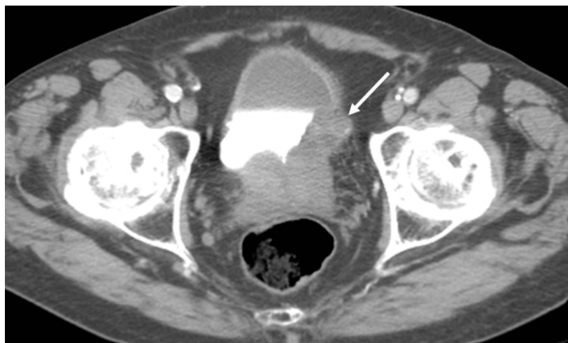
Figure 1 - Axial CT urogram excretory phase images show a lobulated mass along the left wall of the urinary bladder (white arrow).

On postoperative day one, the patient reported abdominal pain and general discomfort. Physical exam revealed a grossly distended abdomen which was tender to palpation with positive guarding and decreased bowel sounds. He