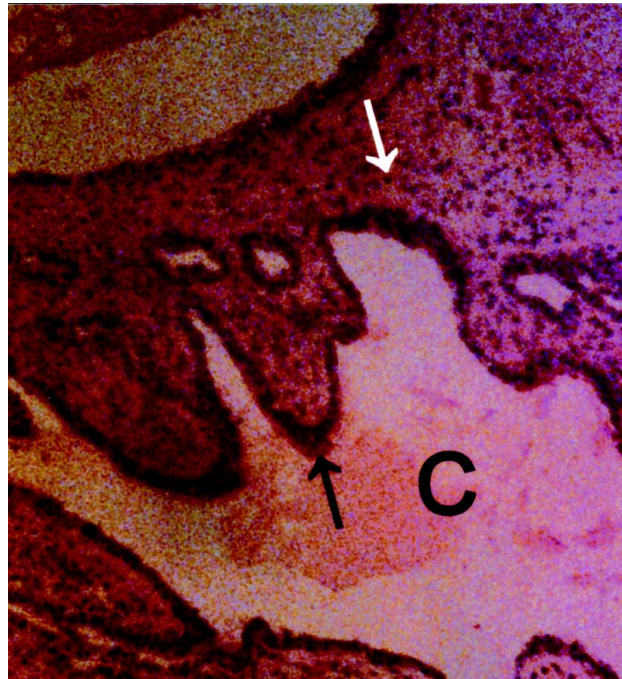
Figure 2 - Histologic examination showing dilated cysts (C) covered by a single layer of cuboid epithelium (black arrow) and filled by amorphous eosinophilic material. The stroma is composed of spindle-shaped cells, without significant atypia (white arrow). There are no mitotic figures or solid epithelial proliferation (HE, X100).

cal of a primary benign epithelial-stromal tumor of the seminal vesicle and so, more properly called cystadenoma (3).