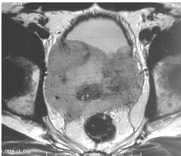
Figure 1 – Magnetic resonance imaging of pelvis, showing a voluminous expansive and infiltrative lesion in prostate.

The definition of primary lymphoma of the prostate is based in several criteria. The main symptoms are urinary, the disease occurs predominantly in the prostate, with or without extension to adjacent tissues and there is no involvement of lymph nodes, liver, spleen or blood up to 1 month after diagnosis (3).