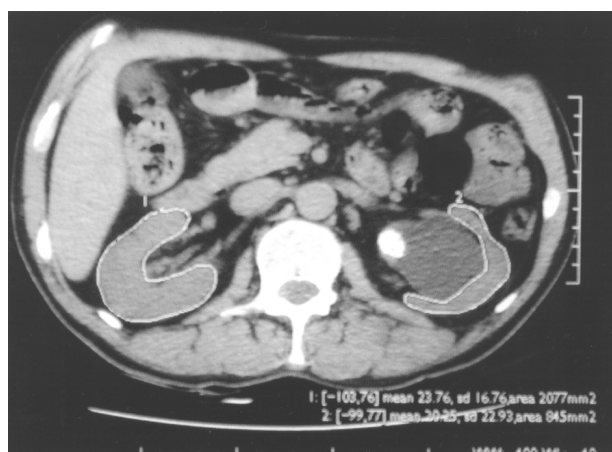
Figure 2 – Measuring the cross-sectional area of renal parenchyma of the kidney on a slide of non-contrast helical computerized tomography images.

NCHCT was then performed using a single slice spiral CT scanner (High Speed Advantage, General Electric, Milwaukee, USA) with 5 mm collimation, pitch 1.5, 120 kV and 210 – 230 mA. The images were reviewed by a single radiologist who was blinded from the cortical thickness measurement by USG. The cross-sectional areas of renal parenchyma of both kidneys on each slide of images were individually marked with the sinus fat and collecting system excluded (Figure-2). Then the volume of the re-