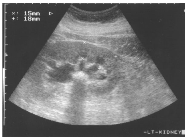
Figure 1 – Measuring the renal cortical thickness by ultrasonography.

Informed consent was obtained for all patients. Ultrasonography (USG) of both the normal and obstructed kidneys was first performed. The cortical thickness at the site with the thickest renal parenchyma in the upper pole, mid-kidney, and lower pole of both kidneys was measured (Figure-1). Then the mean cortical thickness of each kidney (i.e. the mean of the cortical thickness at the upper pole, mid-kidney and lower pole) was calculated for each kidney. The differential cortical thickness of the obstructed kidney (%USGcort) was defined as the percentage of the