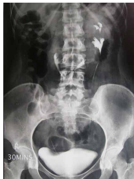
Figure 1 - Intravenous Urogram (IVU) showing bilateral duplex collecting system in horseshoe kidney in which left renal moieties are vertically placed and one of the right sided moiety lies over the vertebra (marked by arrow) while the other one lies to the right of the vertebra. All the calyces are facing medially.

anomalies of the kidneys can generally be placed into 2 categories: [1] horseshoe kidney and its variants and [2] crossed fused ectopia. Horseshoe kidney is probably the most common fusion anomaly. The term horseshoe kidney refers to the appearance of the fused kidney, which results from fusion at one pole. Horseshoe kidney is the most common renal fusion anomaly, the incidence being about 1