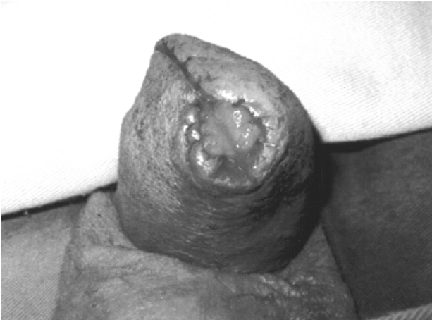
Figure 4 – Creation of the neomeatus using the overlay skin of the penis.

which preconize margins between 15 and 30 mm from the lesion (2). Since the vast majority of penile tumors originate in the glans, coronal sulcus or foreskin, partial amputations are frequently employed. Such margins optimize the possibility of eradicating microscopic foci beyond the macroscopic limits of the tumor, but significantly reduce the penile length (1). The limitations to sexual intercourse and masturbation are obvious in cases of total amputations. However, in patients submitted to partial amputations, despite the reduction in the penile length, vaginal penetration is frequently possible, as well as orgasm and ejaculation (2).