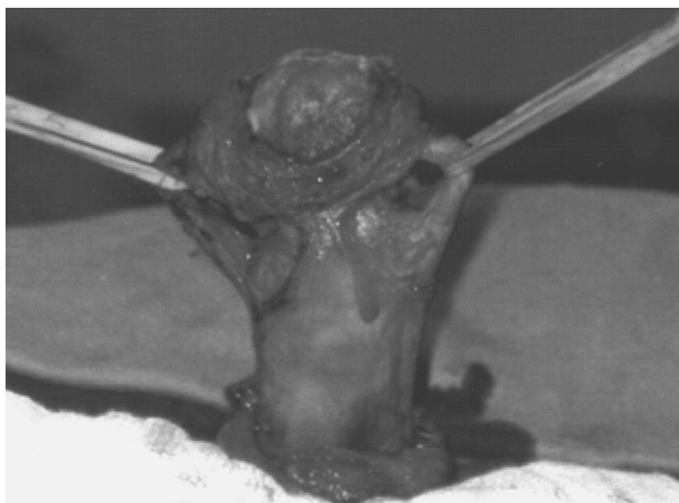
Figure 2 – Dissection of dorsal neurovascular bundle and urethra.

Under spinal anesthetic block, the patient is placed in horizontal dorsal decubitus. The procedure begins with a circular incision of the skin, around the penis, deepening until the Buck's fascia. At this point,