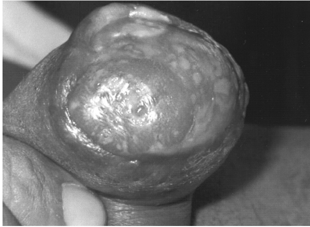
Figure 1 – Epidermoid carcinoma limited to the glans penis, with approximately 2 cm in length.