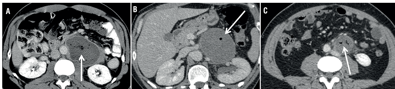
a) 57 years old patient; b) 41 years old patient; c) 34 years old patient; same patient as c) spontaneous decrease in size 4 weeks after the first CT.