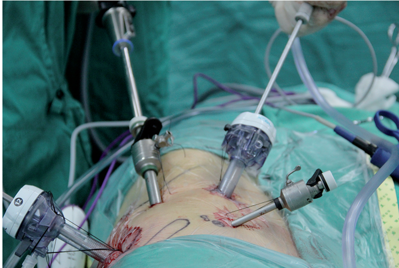
Figure 1 - Positions of the four working trocars.

iliac spine, and 2-cm above the iliac crest for the 30° Olympus laparoscope. Finally, a 12 mm trocar was placed in the initial hole. The Gerota's fascia was cut horizontally from the front edge of the psoas muscle up to the diaphragm and down to the lower pole of the kidney, and the renal hilum