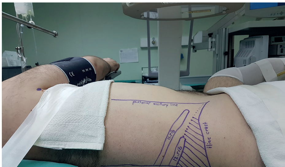
Figure 1 - Galdakao-Modified Valdivia position in supine m-PNL. The shaded area between lower rib, posterior axillary line and iliac crest shows the subcostal access location.

After the induction of general anesthesia, a 5Fr Ureteral catheter was placed and fixed on the Foley catheter in the lithotomy position. The patient was then repositioned in the prone position. Skin surface was marked to indicate the lower rib margin, posterior axillary line and iliac crest (Figure-2). Percutaneous access was achieved under C arm fluoroscopy guidance. The puncture was performed with an 18 gauge percutaneous access needle. Following successful puncture, a 0.035 inch guidewire was advanced through the needle into the PCS or ureter. At later stages, tract dilatation, nephroscopy, stone fragmentation, and stone retrieval were performed in a manner similar to supine m-PNL. All supine and prone procedures were performed by two experienced urologists at the tertiary referral center.