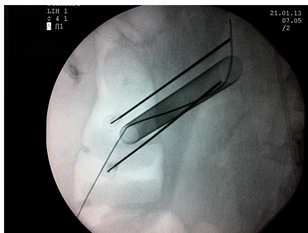
Figure 1 - Intraoperative fluoroscopic view of peritubal injection.

Profiles of patients were not clinically significant different between the two groups (Table-1).