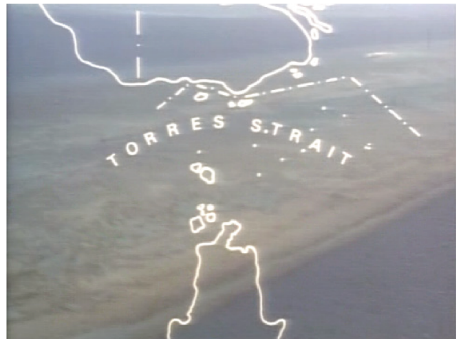
Figure 2: Screenshot from Talking Broken – Torres Strait Map © 1990 Frances Calvert

In the case of the Australian-controlled territory of Papua and the Torres Strait, such a convention began with Frank Hurley’s documentary and feature films of the 1920s, some of the first of their kind to use aerial footage in this context (Australian Screen), but this convention has arguably become the visual cliché of the opening or establishing shots in Torres Strait film, positioning the islands spatially in relation to themselves and/or to the locality, the net rhetorical or semiotic effect of which is often to suggest disconnection and geographical or cultural distance conquered by technocratic power. 5 This is the ethnographic or documentary film equivalent of the power-laden and scene-setting “arrival” in classic ethnographic texts (Pratt).