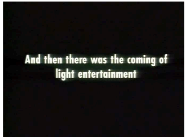
Figure 6: Screenshot from Talking Broken – “[T]he coming of light entertainment” © 1990 Frances Calvert