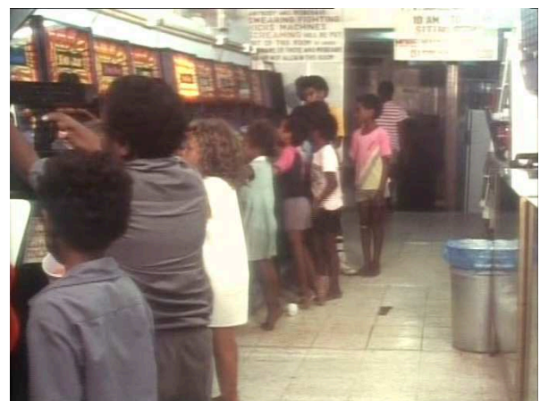
Figure 10: Screenshot from Talking Broken – Video arcade © 1990 Frances Calvert