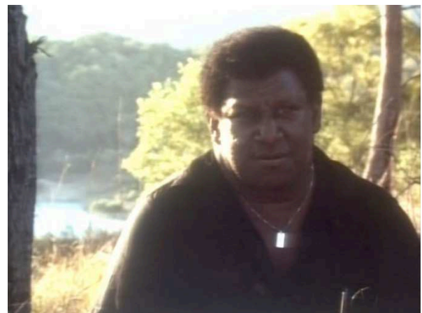
Figure 8: Screenshot from Talking Broken – Ephraim Bani