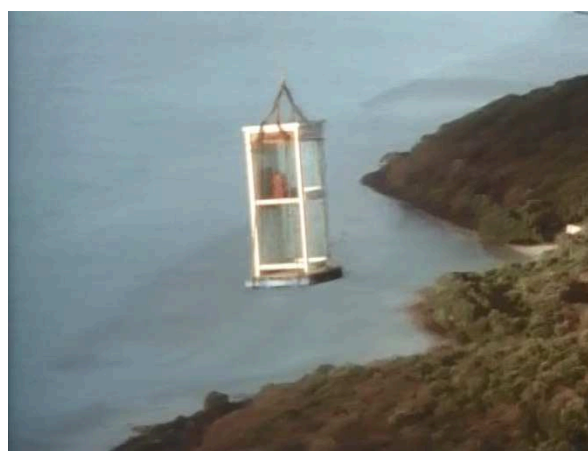
Figure 1: Screenshot from Talking Broken – The “talking broken” motif, 1 © 1990 Frances Calvert

I want to look at this film for two inter-related reasons. The first is that it explicitly thematizes the relationship between space, place and media in a postcolonial context, particularly in relation to film, television, radio and telephony, and the second is that it is set in a wider media context that includes national distribution (in educational institutions and museums, etc.) and international distribution (for TV, film festivals and DVD sales, etc.). I will attempt to address some of these themes by focusing in particular on the film’s characteristically idiosyncratic leitmotif: an aerial shot of a helicopter bearing a telephone-booth on a wire (figure 1).