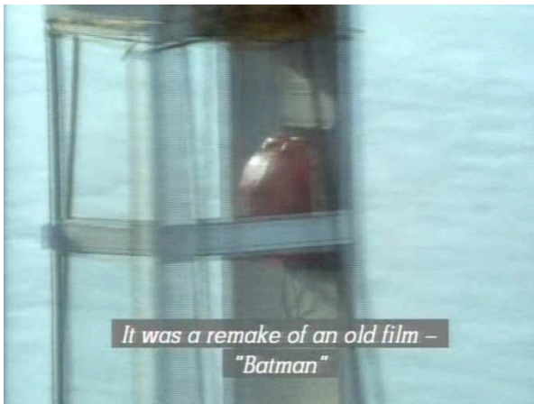
Figure 5: Screenshot from Talking Broken – The “talking broken” motif, 2