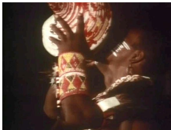
Figure 3: Screenshot from Talking Broken – Shell horn © 1990 Frances Calvert

but they centre on the idea of a mood, atmosphere or tuning, with the root implication of a voice (in this case, a series of non-linguistic voices, often using overtones, that are "tuned" like an instrument, or indeed a radio).