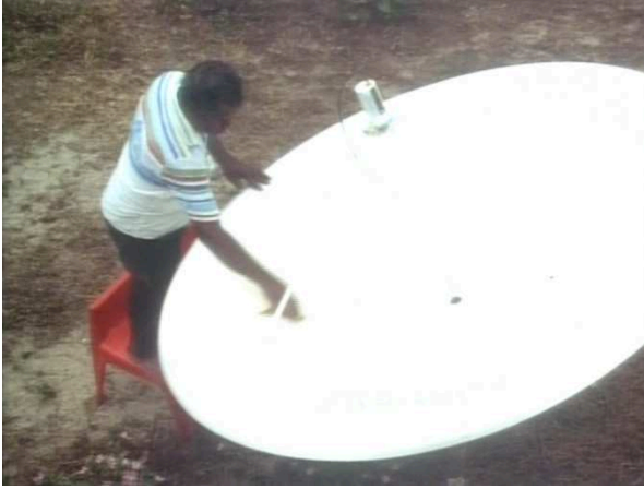
Figure 11: Screenshot from Talking Broken – Satellite dish © 1990 Frances Calvert

Such juxtaposed sequences are undoubtedly intended to be ironic and jarring, and they do make significant inroads into re-signifying the images, particularly the archival photographs, but the point here is not, I think, to make a simplistic claim to “pristine” Indigenous local identities being destroyed by globalized media, but rather to focus on the complexity of contemporary local/global hybridization and the extent to which such hybridity has a long past that precedes colonization, has outlived it and will continue in and through contemporary media rather than outside of them. Indeed, as the main protagonist in the debate, Bani goes on to discuss the importance of not dismissing such media forms per se , but of controlling them, and this is a crucial tenet of contemporary Indigenous media theory (e.g. Hokowhitu and Devadas): not only is control over representations important—but control over the means and institutions of representations (e.g. TV channels, media outlets, etc.).