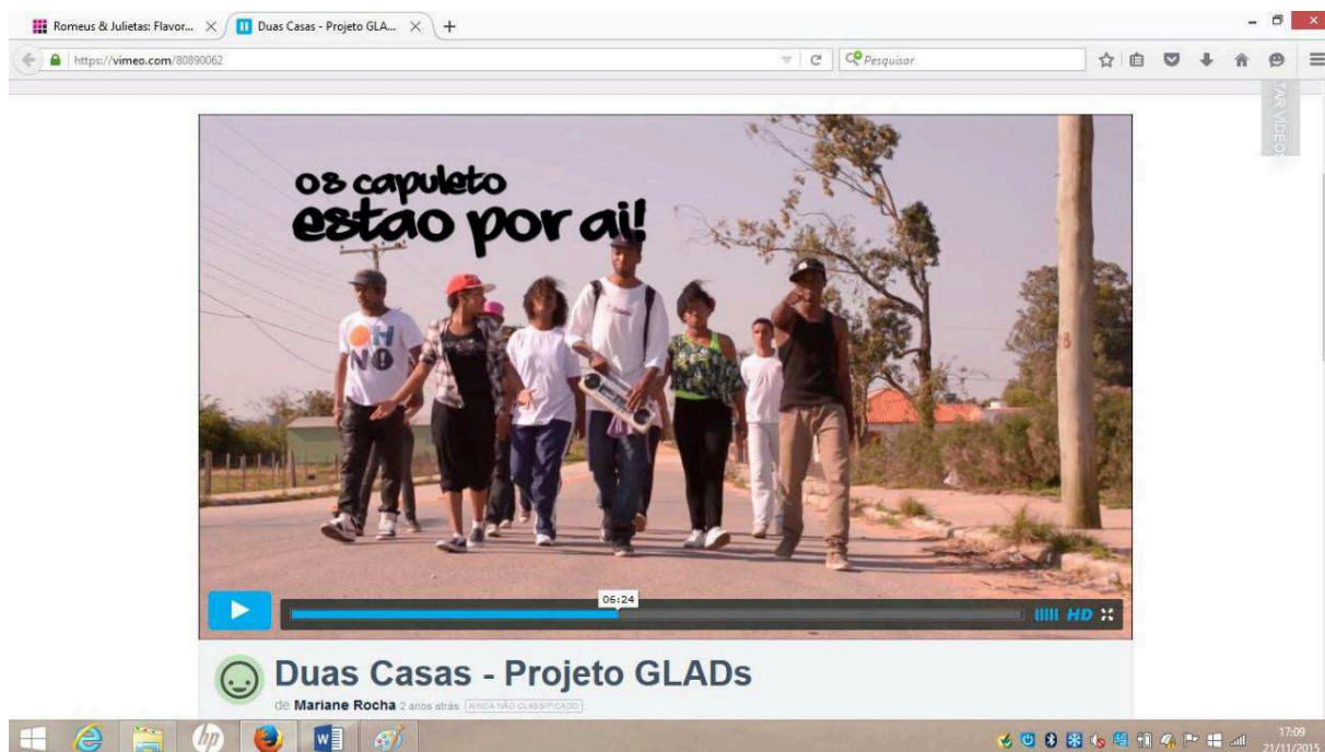
Figure 6: Shot/counter shot of angry teenagers