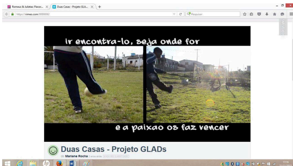
Figure 10: Soccer fields

The cutaway scene quickly returns to the interviews in which the dwellers are describing the relationship between the people from Malafaia and Ivo Ferronato. In different and separate statements, they all conclude by saying that their relationship is mostly peaceful and that the region nowadays is a single community. We have another insertion of a cutaway scene; this time we see the parted screen showing both soccer fields in a full shot; a boy hits the ball trying to score a goal. Also, we can read another passage from the prologue in Act 2: “ir encontrá-lo, seja onde for, e a paixão os faz vencer” 77 while we hear a score that remixes hip-hop and samba (figure 10).