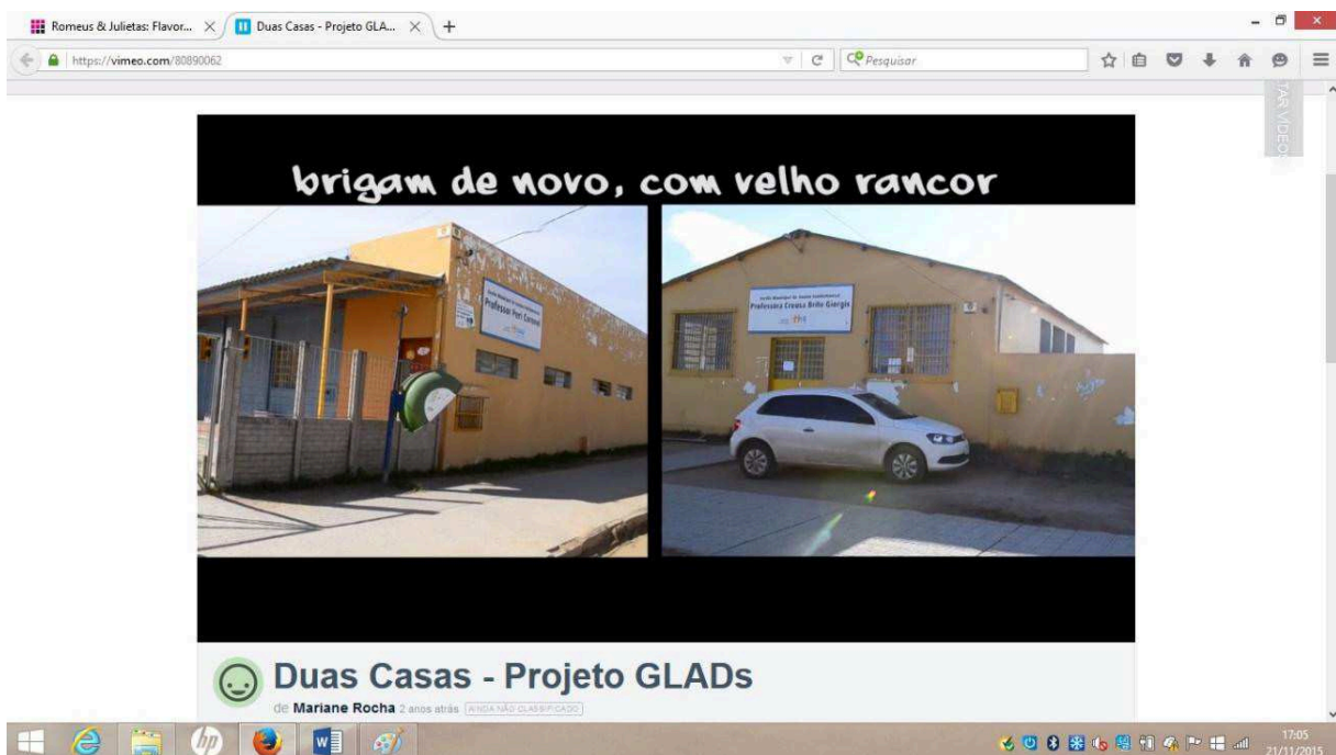
Figure 5: Schools from both neighbourhoods

The cutaway scene is quick and returns to the interview scenes in which the interviewees discuss separately the possible rivalry between the neighborhoods. Again, there is an interruption and the insertion of a cutaway scene in which we see a parted screen showing the schools from both neighborhoods, Malafaiá’s EMEF Peri Coronel (on the left) and Ivo Ferronato’s EMEF Creusa Brito Giorgis (on the right) (figure 5).