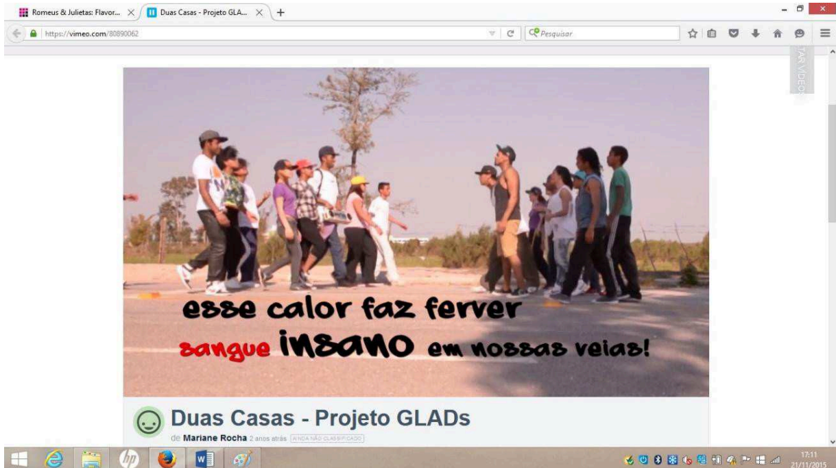
Figure 8: Battle scene

the neighborhoods and leads to the university that we can see far away in the background (figure 8).