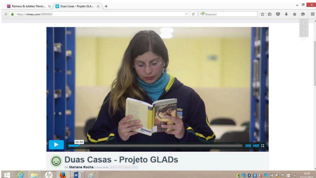
Figure 3: Girl reading the play Romeo and Juliet

The use of these cutaway shots, i.e., shots peripherally related to the main shot (we can call it main shot because the voice of the coordinator persists throughout the scene), might function as a commentary to illustrate the questions that motivated the creation of the project. The following scene shows a young girl wearing a school uniform in a library reading the play Romeo and Juliet (figure 3).