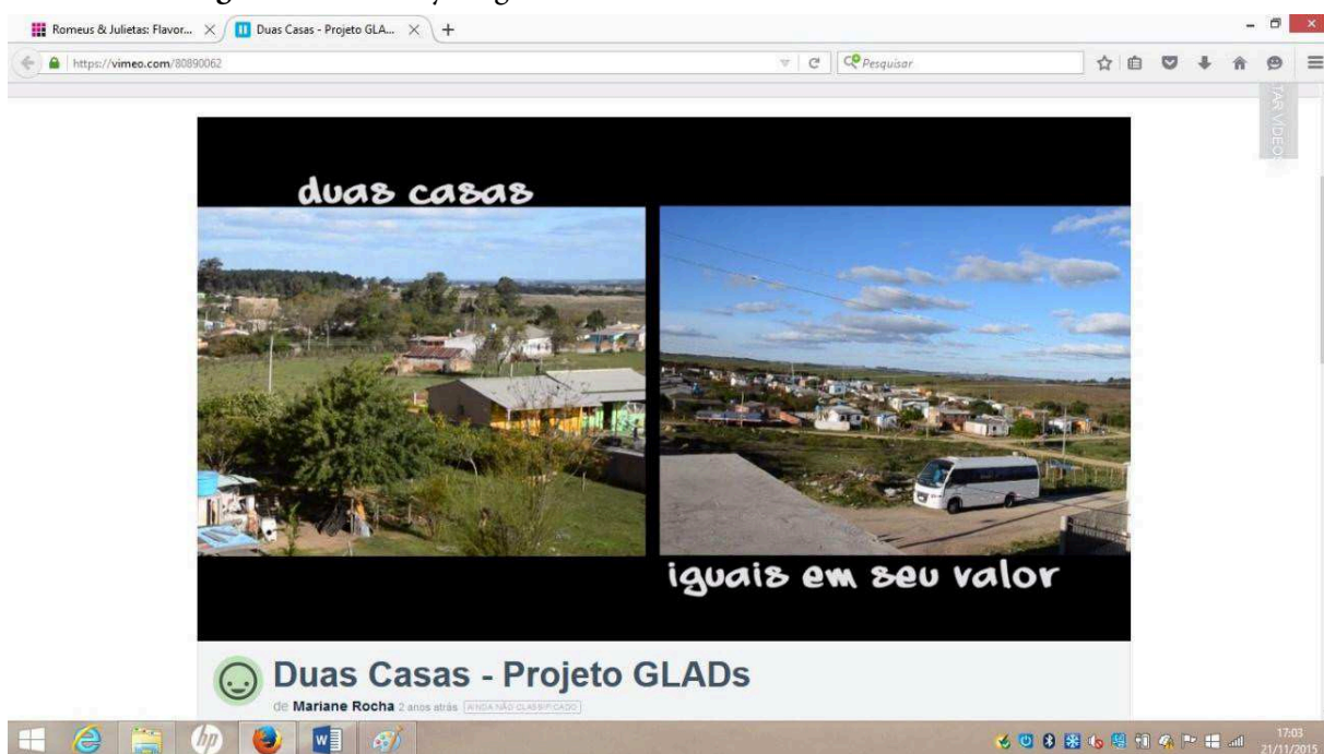
Figure 4: Extremely long aerial shot

After two shots of Malafaiá's dwellers and two shots of Ivo Ferronato's dwellers, there is a cutaway scene, which interrupts the interviewee's statements with the insertion of a parted screen with an extreme long aerial shot of Malafaiá (on the left) and Ivo Ferronato (on the right) (figure 4).