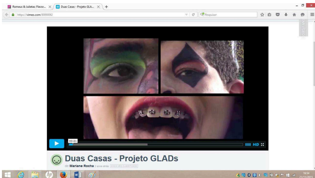
Figure 1: Duas casas – opening scene

The fourteen-minute film Duas casas starts with a sequence of fragmented images that form a disproportionate face, each time with a different mouth or a non-matching eye, representing the faces of several Romeos and Juliets. The projection of fragments of eyes and mouths gradually accelerates until turning into a frenetic rhythm along with the score, suggesting a confluence of several faces into a single one (figure 1).