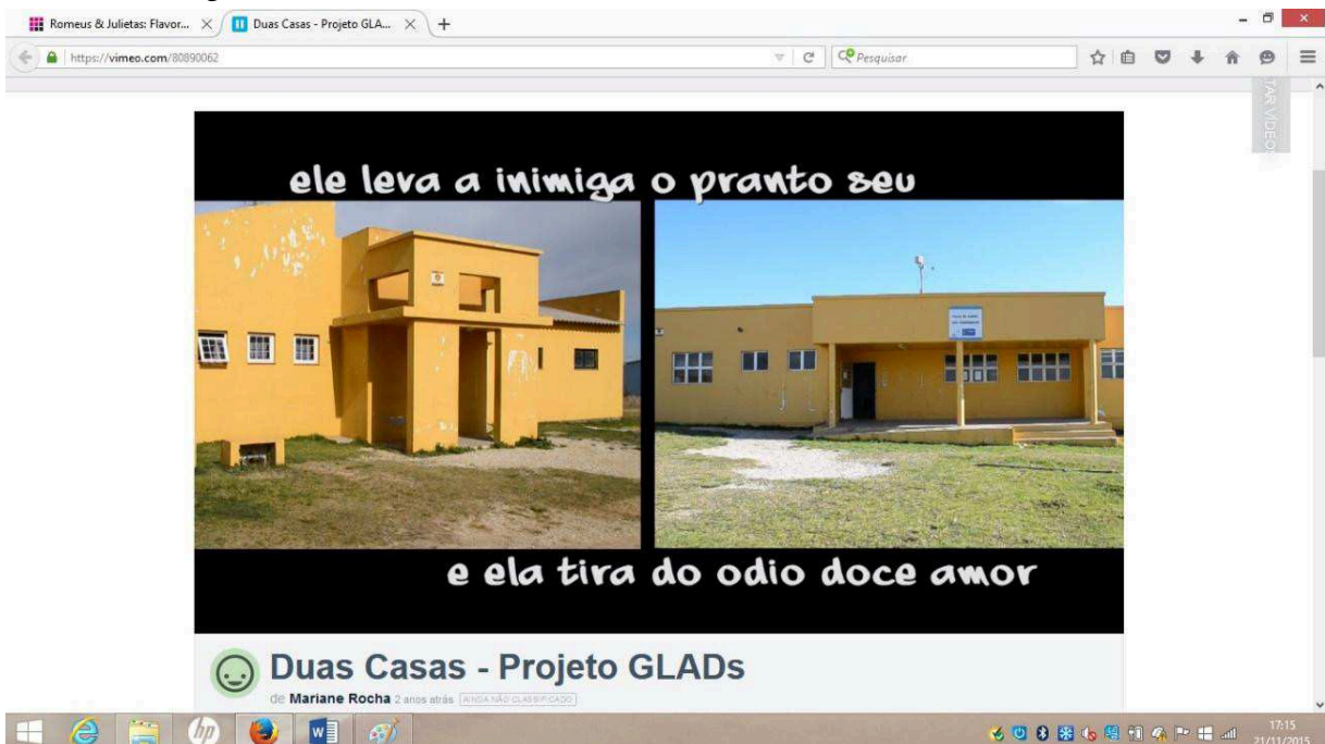
Figura 9: Health centers

After the battle scene, we have another cutaway scene, this time, a parted screen showing both health centers, again very much alike, and we read a passage from the prologue in Act 2: “ele leva à inimiga o pranto seu e ela tira do ódio doce amor”, 6 which might suggest the healing power of love (figura 9).