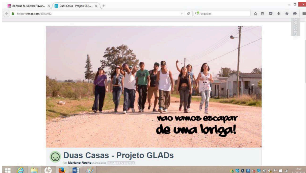
Figure 7: Shot/counter shot of angry teenagers