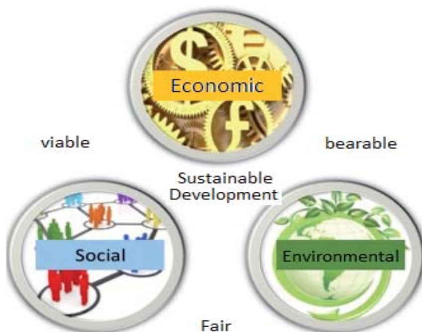
Figure 1 - Triple Bottom Line

reasonable development without the active participation of the referring to the limits, that consider the local resources, both human and natural (CARDOSO, 1993). These limits, so expensive to Local Development and that leverage when the blokes of its own history build its reality, which can be seized by the investigators through appropriation of this theoretical construct.