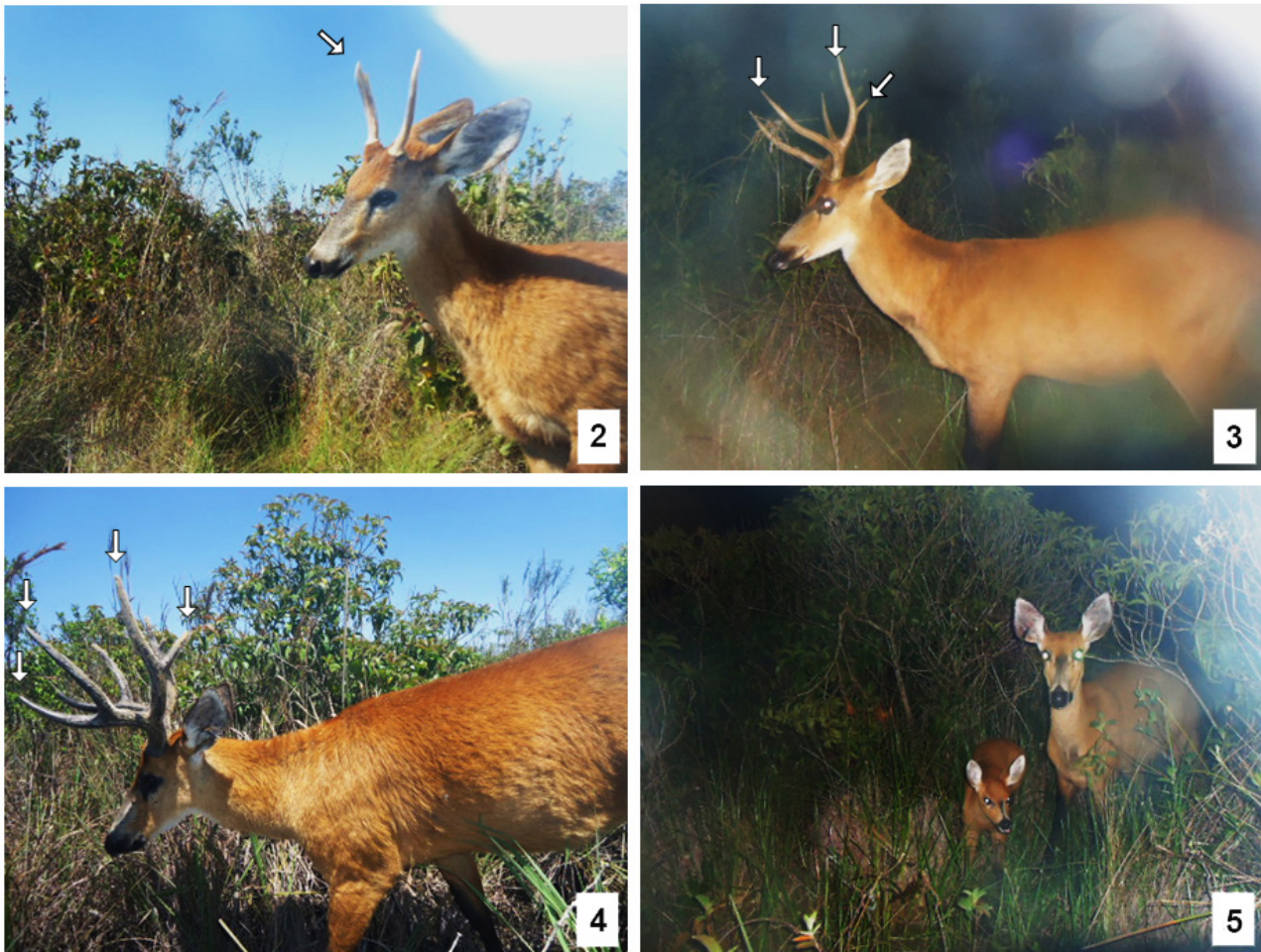
Figs 2-5. Individual discrimination of marsh deer males ( Blastocerus dichotomus Illiger, 1815) using antler morphology: a spike-antlered male (2) and two different branched antlers (3 and 4). The arrows indicate the different horn tips. Marsh deer female accompanied by a fawn (5).

antler morphology to a Neotropical deer species. Our results confirm the veracity of this technique for the differentiation of branch-antlered marsh deer males. Despite the fact that no males with velvet antlers were recorded in this survey, special attention must be given to those records if they appear, due to the ongoing growth of velvet antlers. Similarly, survey duration should not be neglected and short term sampling is the best choice because males can shed their antlers anytime of the year and young males tend to do it more frequently (PEREIRA, 2010; H. G. C. Ramos, unpubl. data)