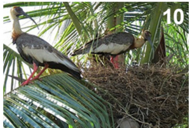
Figs 7-10. Records with evidences of breeding activities of the Buff-necked Ibis ( Theristicus caudatus ) obtained in the Brazilian Pantanal wetland: 7, two adults and a nest being built at Poconé, MT; 8, an incubating adult at Poconé, MT; 9, a young being cared in a nest at Miranda, MS; 10, two young with adults in a nest at Aquidauana, MS. Records were gathered in the WikiAves database, except for Fig. 9.

three species of the family Arecaceae ( Attalea phalerata , Copernia alba , and Cocos nucifera ).