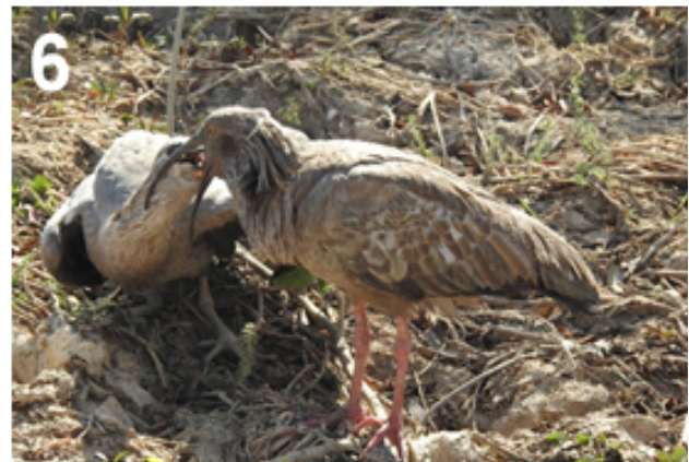
Figs 3-6. Records with evidences of breeding activities of the Plumbeous Ibis ( Theristicus caerulescens ) obtained in the Brazilian Pantanal wetland: 3, two adults building a nest at Poconé, MT; 4, an incubating adult at Poconé, MT; 5, an adult and a nestling in a nest at Corumbá, MS; 6, an adult feeding a young on the ground at Poconé, MT. Records were gathered in the WikiAves database.

and October (Appendix). As a result, records of breeding activities of T. caerulescens tended to be concentrated in the dry season (69%), being less numerous in the rainy season (31%) (Fig. 2, Appendix).