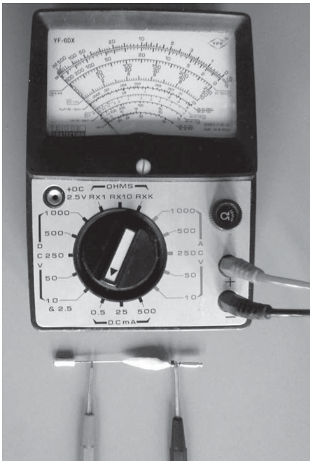
Figure 1- The experimental setting showing the ohmmeter with the poles connected to the files

Forty-five teeth instrumented as described ( n=15 for each instrumentation technique) were allocated for testing the microleakage after root-filling of the instrumented teeth. The teeth were taken out of the alginate molds. The root canals were dried using paper points and filled using gutta-percha and sealer (AH Plus, Dentsply/DeTrey, Konstanz, Germany) with the lateral condensation technique. A size 40 gutta-percha cone was used as the master cone. The gutta-percha cones were coated with sealer before insertion into the canal. The teeth were checked radiographically (RVG, Trophy Radiologie, Paris, France) from the labial and lateral aspects for the quality of the root filling (e.g. homogeneity of the filling or presence of a void). All root surfaces were covered with nail polish with care to avoid the apical foramen. The access cavities were sealed with a temporary filling. Ten endodontically accessed-teeth were not obturated and served as positive control. The teeth were stored in physiological saline with